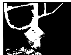
Save Your Curb With Our Stainless Steel Curb Model