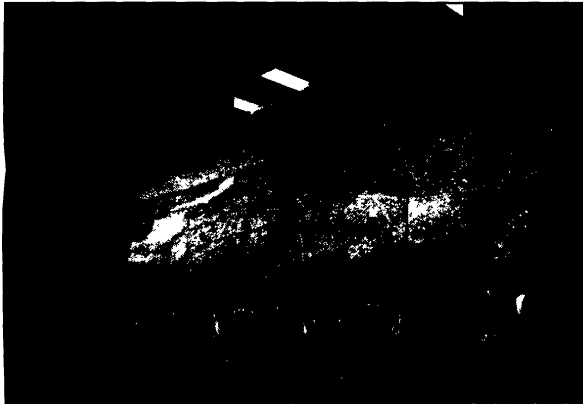
The mural in the New Foyer was unveiled last Saturday.