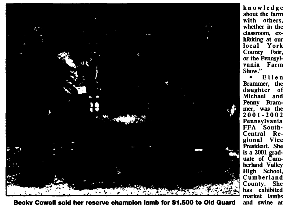
Becky Cowell sold her reserve champion lamb for $1,500 to Old Guard Insurance, Lititz.