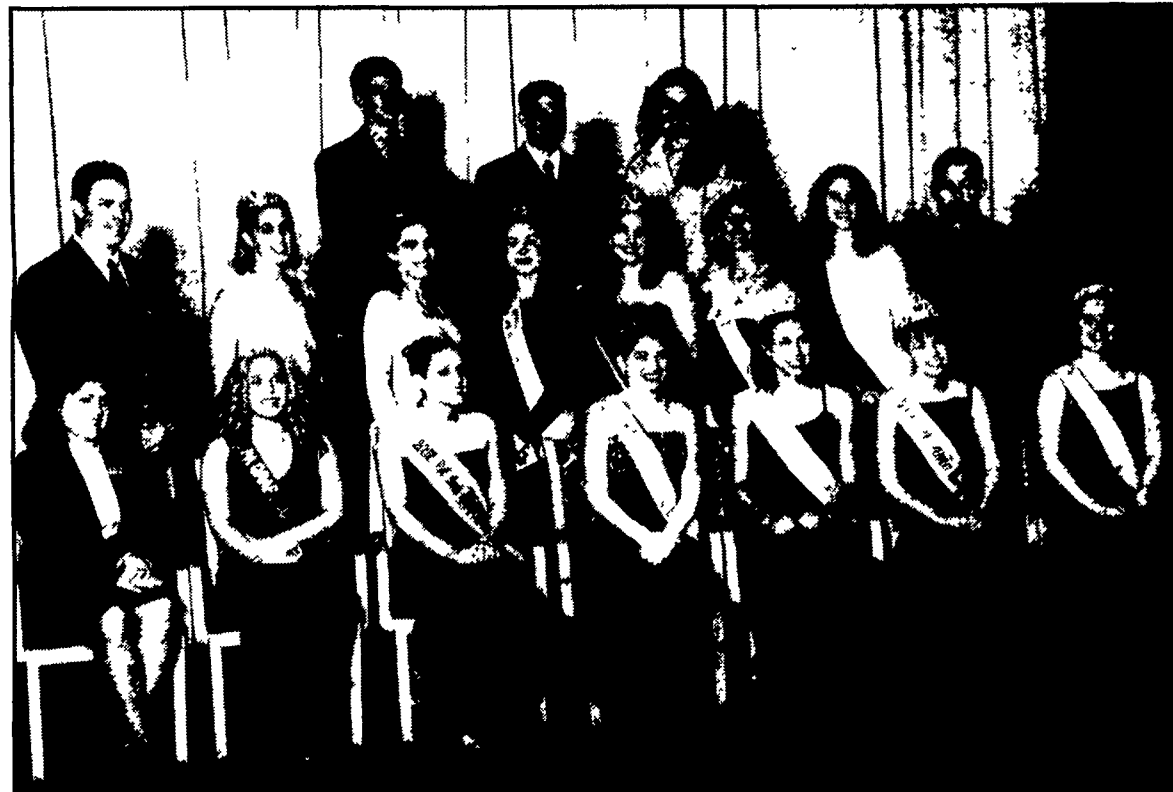
Agriculture commodity representatives gather for the reception at the start of Agro 2003 late last week.