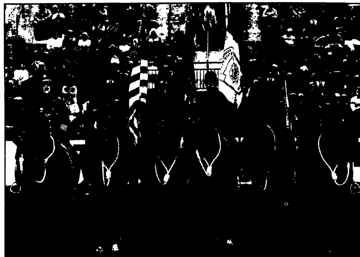
The state police color guard at this year's Grand Opening at Farm Show.