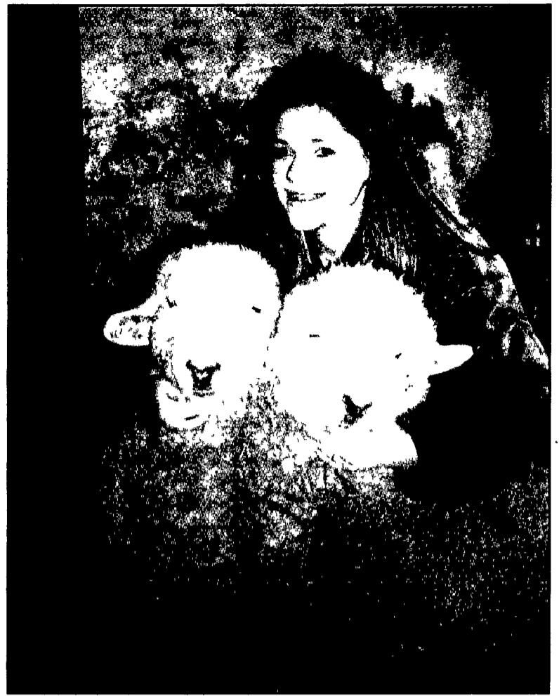
"Peaches" and "Savannah" will compete Friday and Saturday at the Farm Show.