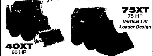
40XT 60 HP