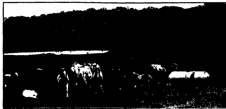
One of David's jobs is to let these paint horses in and out of the barn each day.