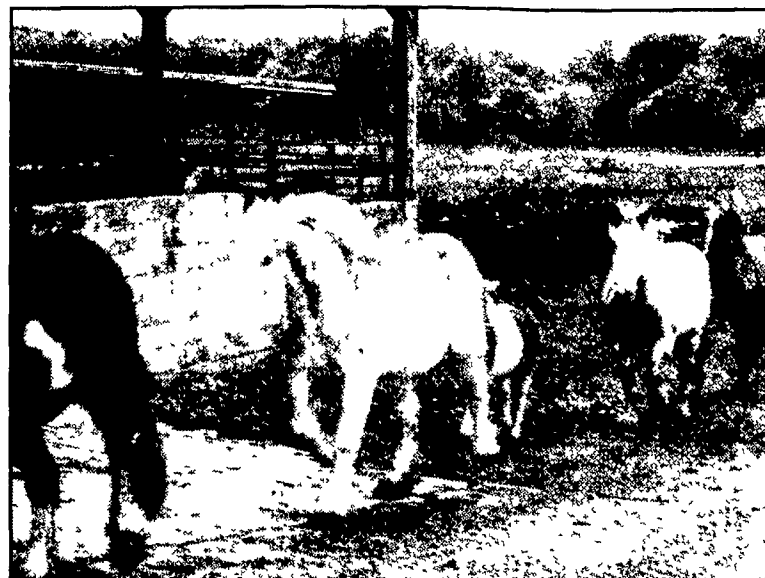
Two driving horses, one pony, and 10 work horses are part of the farm.