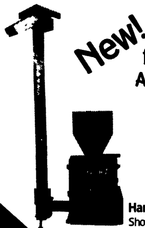
Hammermill 1215 Shown with optional auger

Join us at the Keystone Farm Show January 7, 8, & 9 Booth #W654