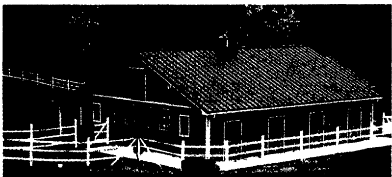
Complete Building Packages, Trusses And Glue-Laminated Timbers

717-866-6581 701 E. Linden St. Richland, PA 17087