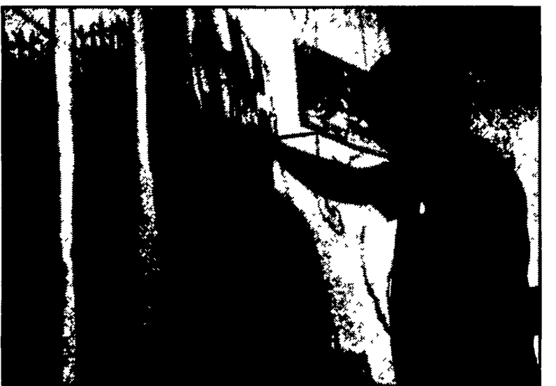
Assistant Mark Brosseau looks off of the color copy of the sketch to fill in the outlines on the canvas.

CONGRATULATIONS PA FARM SHOW COMPLEX NEW EXHIBIT AREA EXPANSION