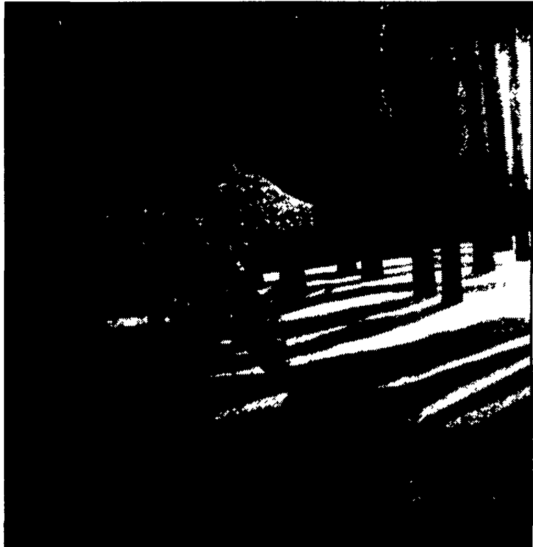
These concrete mirror images on the left and right sides of the mural, animals patterned after designs on the original Farm Show building.