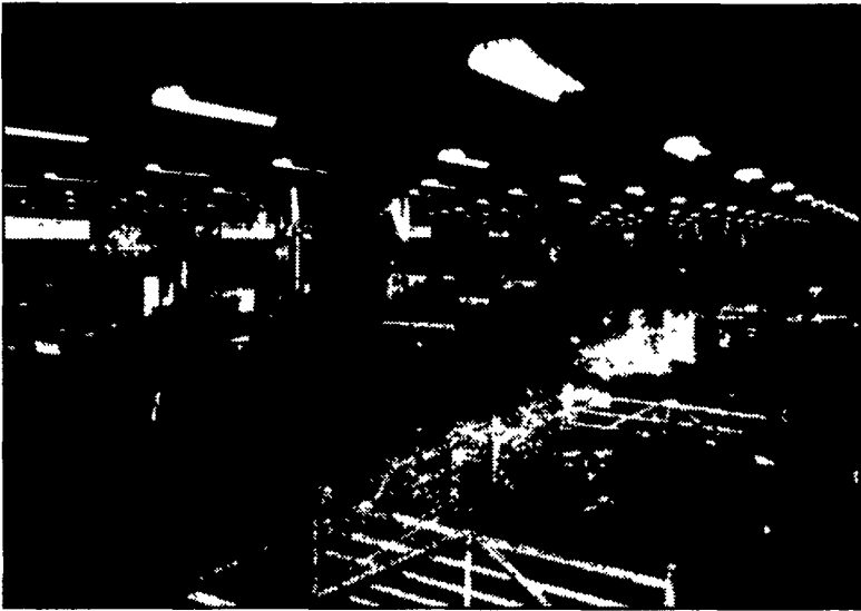
Equipment from a bygone era on display. Anybody still use this stuff?