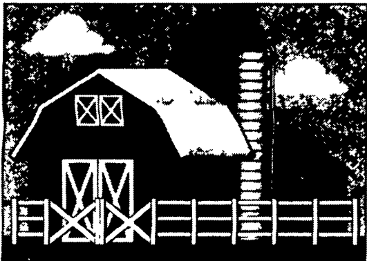
(Turn to Page E27)