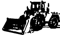
Syracuse (Evenings) (315) 637-8912

TERMS & CONDITIONS: Cash or Company Check accompanied by current "Bank Letter of Guarantee", made payable to Alex Lyon & Son NO EXCEPTIONS!! Everything sells AS IS, WHERE IS, everything sells to the highest bidder without minimums or reserve