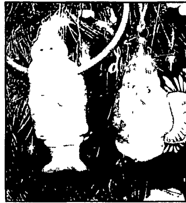
Santa on a hoop, which is at least 70 plus years, and a glass Santa of about the same vintage have a spot on the tree.

A few of the glass ball lost their luster when they were stored in the kitchen of the Washington Perce apartment and there was a natural gas stove. It caused the shiny glass to dull.