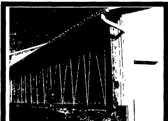
Delta, PA 8'x48' Installation

Hackettstown, N.J. Report Supplied by Auction December 17, 2002 Hay—Straw—Grain ALFALFA 3 LOTS, 4.50-5.10 MIXED HAY 19 LOTS, 1.30-4.30 BALE. TIMOTHY: 3 LOTS, 2.60-2.90 BALE GRASS 15 LOTS, 1.70-3.20 BALE MUCH 2 LOTS, 1.30 AND 1.70 BALE OAT STRAW 2.40. WHEAT STRAW 9 LOTS, 1.85-2.30 FIREWOOD 45.00 53 LOTS TOTAL.