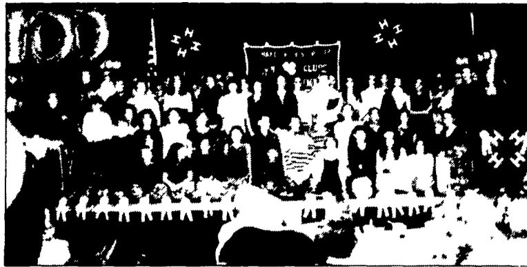
Northampton County 4-H members were recognized at the 4-H Centennial Achievement Banquet.