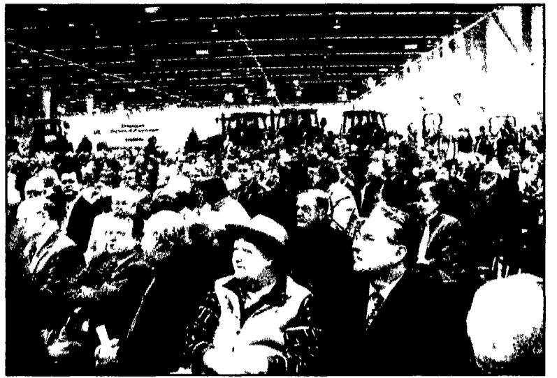
About a thousand people attended the ribbon-cutting ceremonies in the new Exhibit Hall at the Farm Show Complex Tuesday morning.