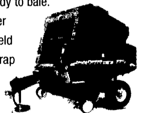
7 Series Round Balers