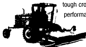
Rotary and sicklebar windrowers

A serious hay crop demands a serious performer the new 4995 Self-propelled Windrower. Extra power now 182 hp, the highest in its class easily takes you through hilly ground and tough crops. New Goodyear™ tire options add reliability and improved field performance.