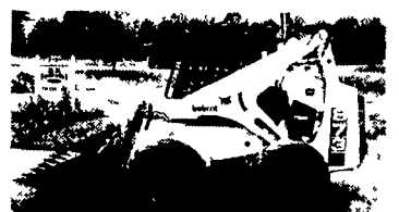
Bobcat 873 w/1700 Hrs. $14,500