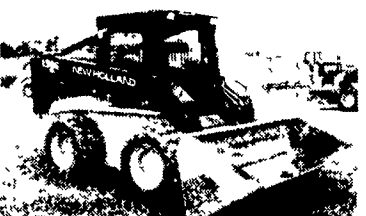
99 NH Skid Steer XL985 $18,500