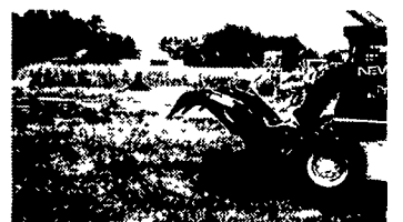
New 78" Root Grapples.....$2,200