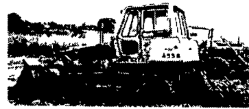
JD 655 Crawler Loader, Rebuilt Engine $16,500