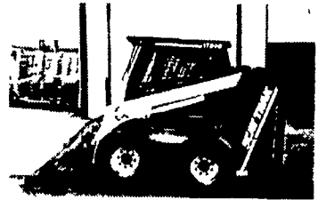
(3) 97 Scat Tracks (2) 1700C (1) 1800C, Good Machines.....$7,800 to 8,200