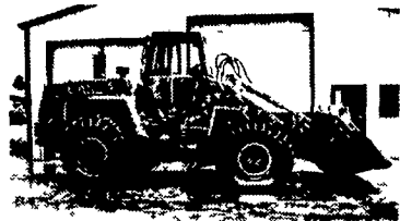
Case W30 Wheel Loader, Clean Machine $18,500

100% Financing w/Good Credit at 8% or less Int. in PA