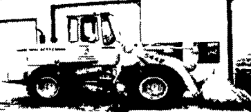
JD 544E, 1990, 7200 Hrs $30,000