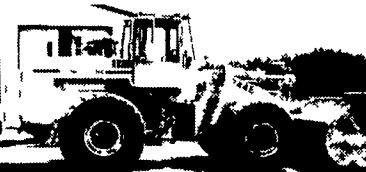
90 JD 744E Wheel Loader, New Paint, Runs Nice $39,000