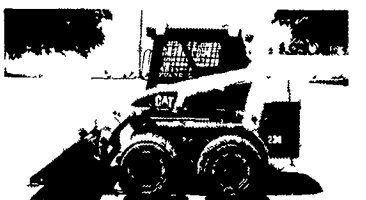
99 Cat 226 Skid Loader, 600 Hrs., Cab & Heat .....$15,500

JD 550G w/ 6- Way Blade, New Paint, Good Bottom.....$26,500