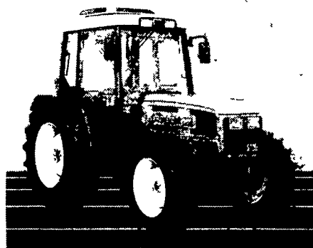
SAME. THE MOST PRIZED TRACTOR IN EUROPE.

FRUTTETO 60, 75 & 85, 2-WD & AWD models. Just 57.4" wide with engines ranging from 60 to 85 HP. Factory installed air-conditioned cab with carbon filtration. Synchronized shuttle, 25 MPH with integral front brakes and optional front PTO.