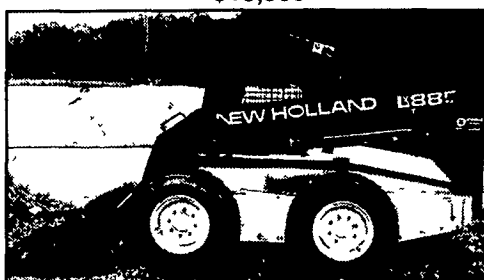
97 NH LX885, 3200 Hrs $10,750

95 NH LX665, 1000 Hrs $10,500 93 Mustang 940, 3400 Hrs $6,500 94 NH 783, Bucket & Forks, 2400 Hrs $9,500 New Pallet Forks $495 72" Root Grapples $2,200