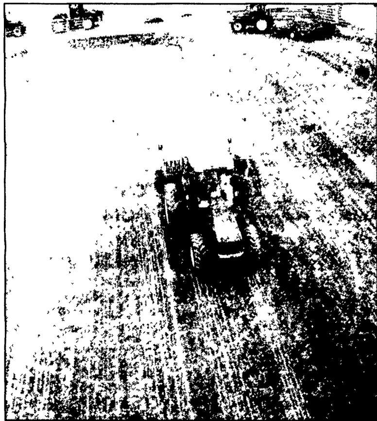
Live demonstrations of grain drills will be featured Monday and Tuesday by various dealers and distributors.