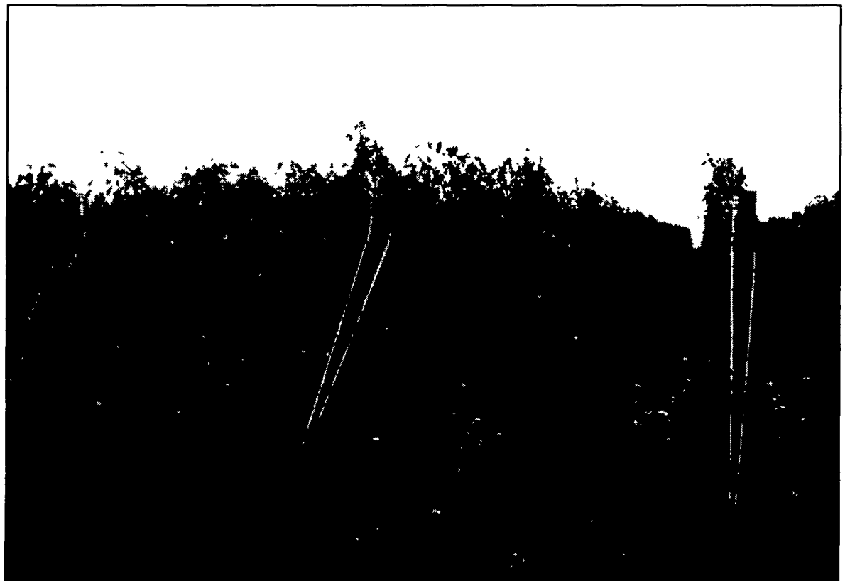
Waltz uses a small plow to hill the rows in the fall to prevent freezing of the grafts near the vine bases. The hills will also help control weeds next spring.

"Quality-wise, it's looking like it's going to be a real good year."