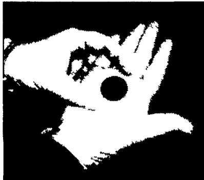
This is an English token dated 1795 and used instead of cash to pay lacemakers. The token could be redeemed at a dry goods store.

Her philosophy is "he who dies with the most thread, wins."