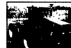
A 43937 1997 CIH 9390 4WD Cab, 3727 Hours, Front & Rear 20 8x42 Goodyear Triples, 4 Remotes, Owners Manual, 425 ENG HP