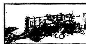
A 24331 1999 Krause 6318A Landstar, 18' Cut, Disc Gangs, K-Tine Shanks, Star Wheels, Tine & Reel