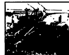
B 24499 1993 Great Plains 30' NT Drill, 3" Press Wheels, 48x7 5" Spacing, New Openers