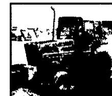
C 42634 1982 IH 5088 Cab, 8115 Hours, 3 Pt Hitch, AC/Heat, Tires Front-11x16SL, Rear-18.4x38, PTO Shield, Gear, Top Link, Diesel, 136 HP