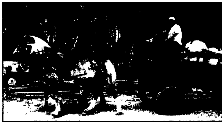
Reunion visitors enjoy a draft horse-driven wagon ride.

There were tractor pulled wagon rides and wagons pulled by draft horses.