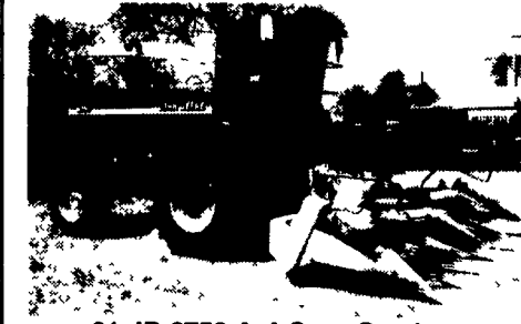
01 JD 6750 4x4 Corn Cracker, 200 Hr., 10' Hay Head, 6 Row Independent Corn Head $189,000 $173,000