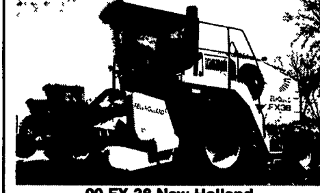
00 FX 38 New Holland, 4x4 Corn Cracker, 700 Cutter Hr, 900 Engine Hr, Hyd Outlets, 6 Row Corn,10 Hay $176,000 $159,900