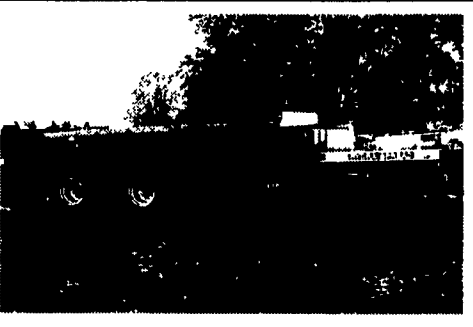
Hydro Push Spreaders in stock