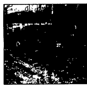
Angles, Channel, Plates, Etc