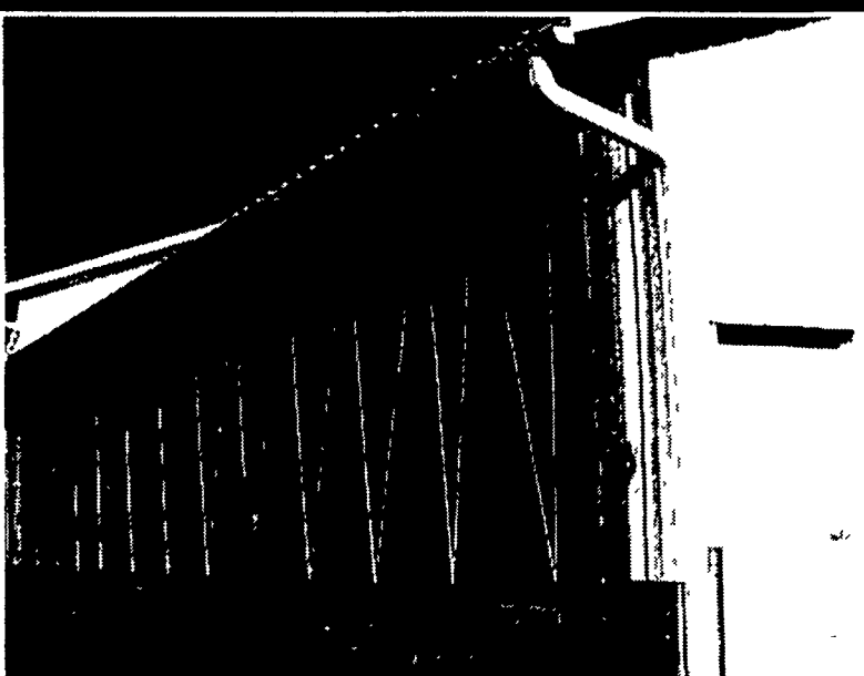
Delta, PA 8'x48' Installation