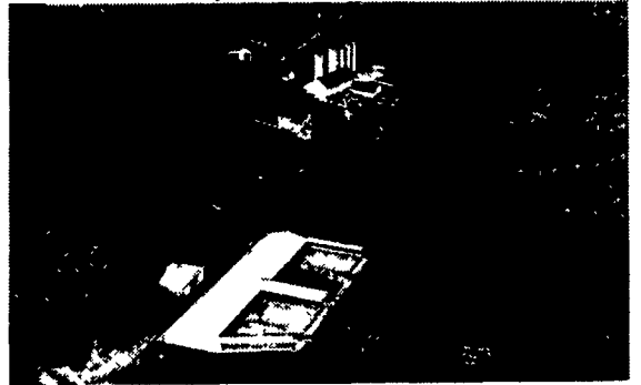
#2. 60 Acres, approx. 50 tillable, silo, barn, 250 steer capacity feed lot, 2 story farmhouse, 2 car