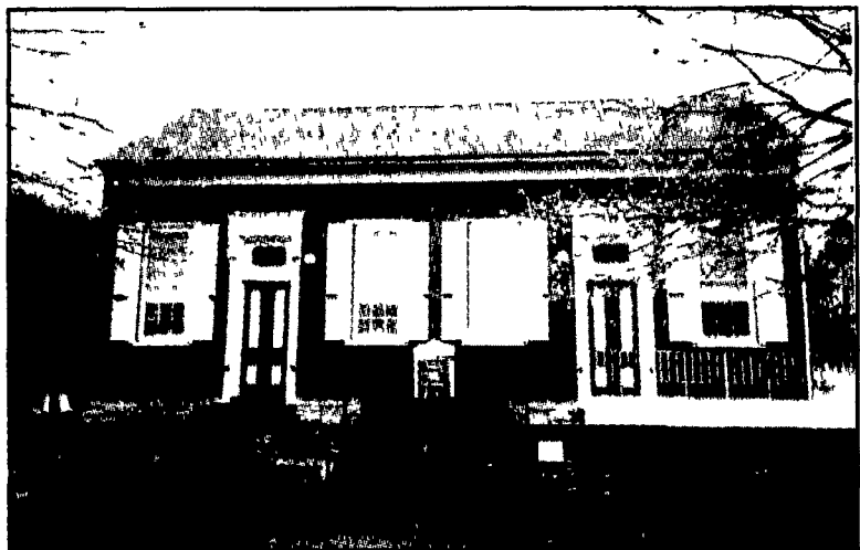
North Heidelberg Church