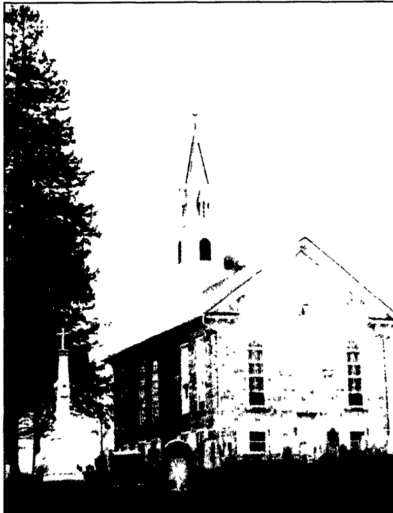
St. Paul's UCC Millbach Church