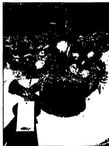
Apryl Smith's best of show was a dried arrangement of colorful summer flowers.