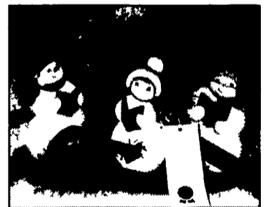
Best of show in wooden crafts.