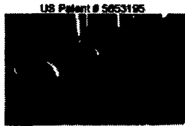
Pasture Mat and PM Plus installation in an old tie stall barn.

No cow mattress system mimics mother nature better!