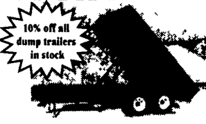
Triple Crowns Dump Trailer

16'x77", 18'x77", 16'x83" 18 x83" w/3500lb or 5200lb axles, radial tires, brakes all the way around, w/break away