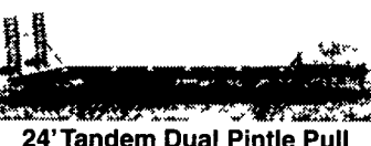
24' Tandem Dual Pintle Pull

capacity 12,000#, 6" channel frame with 6" channel wrap-around tongue two 6 000# eight lug 750x16 Tires all wheel electric brakes with breakaway kit