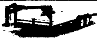
20' Lowboy Gooseneck

load capacity 13 000#, 8" I-beam frame, two 7 000# eight lug EZ Lube axles all wheel electric brakes with breakaway kit