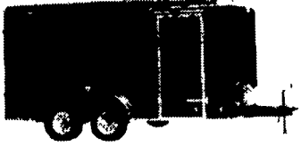
Closed Utility Trailers

3,500# tandem axles, 24" crossmembers on floor, 16" crossmembers on walls, 3/8" plywood walls, 3/4" plywood floors