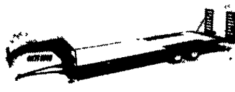
28' Tandem Dual Gooseneck

10" channel frame (15 3 pounds per foot), tandem dual oil bath axles, all wheel electric brakes with breakaway kit 2" treated wood floor (20 flat deck 4' dovetail), stake pockets and rub rails