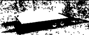
20' Hauler Tag-Along Deckover

load capacity 20,000# height of deck 35", 10 I-beam frame, 10 000# tandem dual oil bath axles all wheel electric brakes with breakaway kit