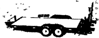
18' Contractors Special

6'x10', 6'x12, 7000 lb GVW & 10 000 lb GVW Powder Coated 6'x12' 12,000 lb GVW, twin cylinders, 750x16 tires 8 lug $4,695