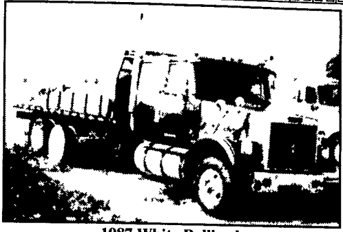
1987 White Rollback

22 Jerr Dan 53 000 GVW G 71TAB Detroit 320 hp 9 spd 227 000 Miles, P/S A/B Jakes, Excellent Cond 717-776-7725 $12,750.00 O.B.O.