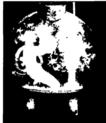
Porcelain pate-sur-pate vase. Minton.

The ceramic world is full of fancy name descriptions...many in French. A good example would be a pate-sur-pate porcelain vase. This painting technique was used in the late 19th century by Sevres, Minton, Meissen and others. The effect is of a cameo, in slight relief the result of successive layering of semi-fluid white slip. The backgrounds are tinted.