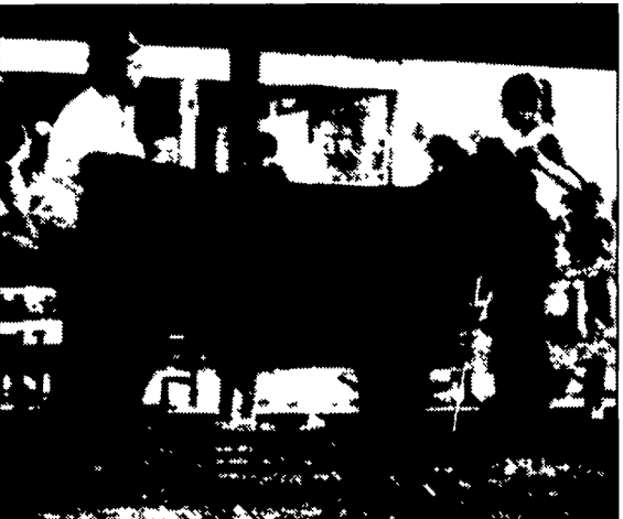
The champion Simmental female, above, was also chosen the supreme champion female at the South Mountain Fair Open Beef Show.

GETTYSBURG (Adams Co.) — The 80th South Mountain Fair Open Beef Show this year featured supreme female and male classes, which gave each breed a chance to earn top honors.