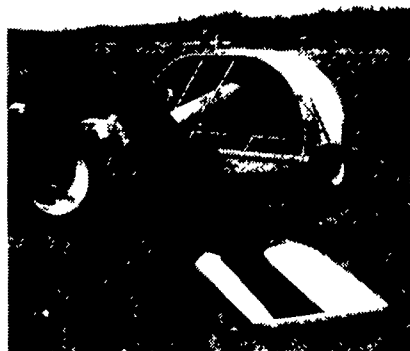
Pro Grain Bagger

Cost Effective Grain Storage Wet or Dry Grain & Commodities Unlimited Storage High Capacity Controlled Airtight Environment Portable Up to 14,000 bu per Bag Works with any type of truck