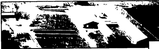
State-of-the-Art 1,000 Cow Milking Facility

Large or Small, Contact King Construction For Design and Construction