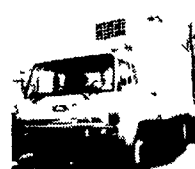
92 Hino Model FE 6 cyl turbo diesel, 6 spd hyd brakes, 18' reefer body w/rollup door, roll up curb side door