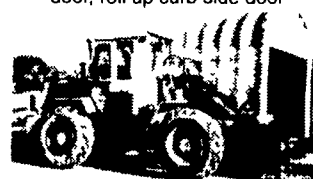
Michigan Loader Model L30 Quick Coupler, Comes With 1 Yard Bucket and 60" Forks, Runs Excellent