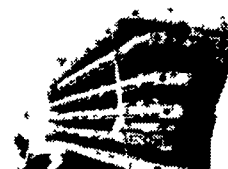
New Flatbeds Available Sizes currently available are 12', 14', 20', 22' and 24' Racks are also available