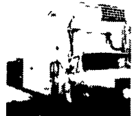
96 Morgan 22' Reefer Body Swinging back doors, curb side door, damage on Thermo-King sheet metal

HEAVY DUTY TRUCK PARTS - NEW & USED - REBUILT REARS & TRANSMISSIONS 610-269-1298 Fax 610-269-0787 www.cohentruckparts.com