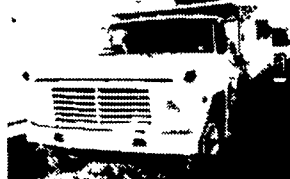
1968 Ford F-600 330 V8, 4spd, 2spd rear hydraulic brakes, 9' dump body, 21 000 GVW runs excellent