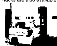
Kalmar Forklift , propane powered, 4435 lb capacity, 42" forks, 192" lift, cushion tires, 2194 hours