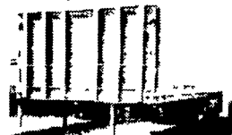
(9) 40' - 45' 1970's & Newer Steel Flatbed Trailers (also have drop deck trailers) some have sliding tandems, all in good condition $2,500/Ea. and Up