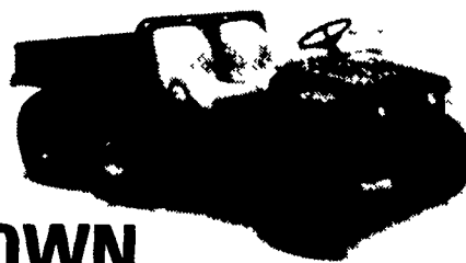
The Gator 6x4 UTILITY VEHICLE