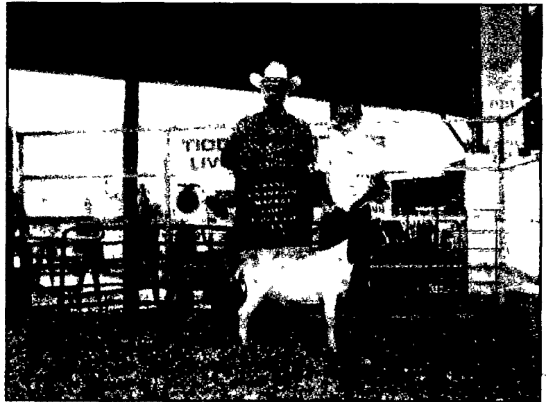
Joseph Sepiol, right, sold the grand champion market goat to Jersey Shore Livestock Auction.