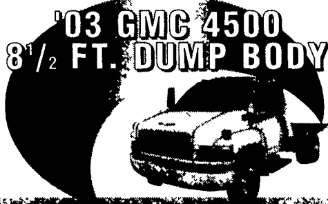
'03 GMC 4500 8 1/2 FT. DUMP BODY