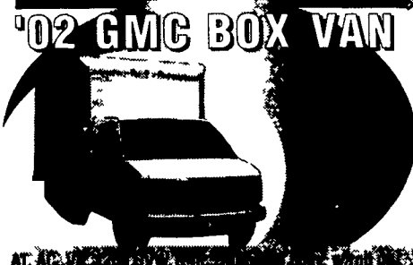
'02 GMC BOX VAN

Special Commercial Discounts Now in Effect