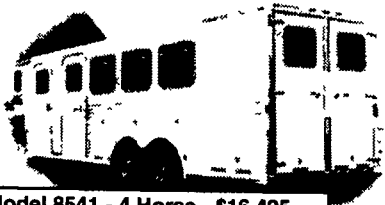
Model 8541 - 4 Horse - $16,425