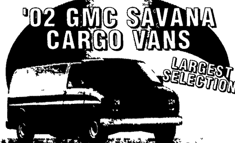
'02 GMC SAVANA CARGO VANS

Special Commercial Discounts Now in Effect