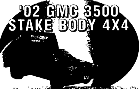
'02 GMC 3500 STAKE BODY 4X4

Special GMAC Commercial Lease Programs Now Available