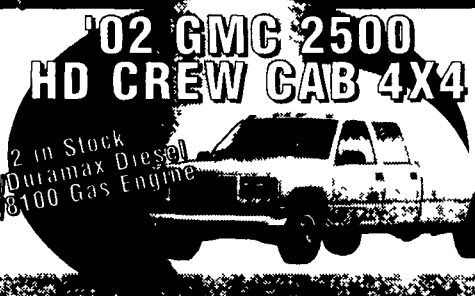
'02 GMC 2500 HD CREW CAB 4X4

2 in Stock 1 w/Duramax Diesel 1 w/8100 Gas Engine