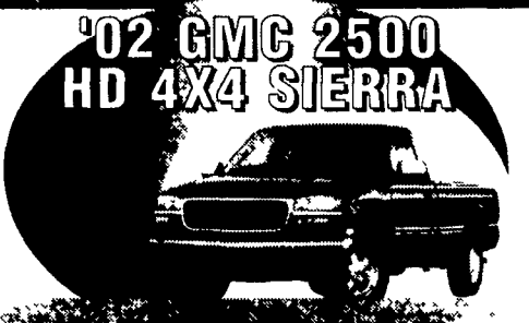
'02 GMC 2500 HD 4X4 SIERRA