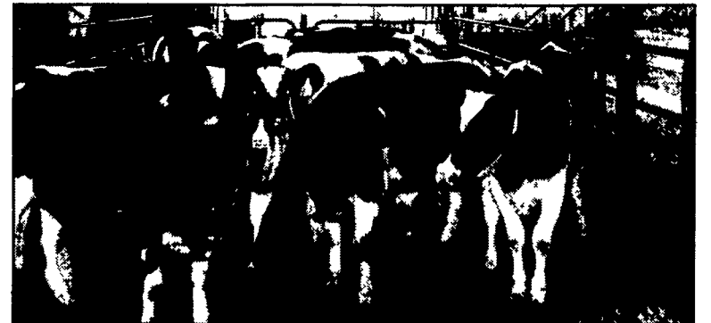
"Plan to be with us all day"