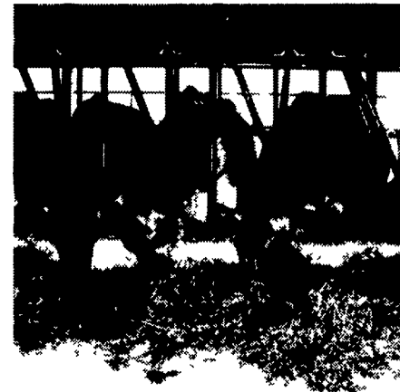
Auto Release Self-Locks