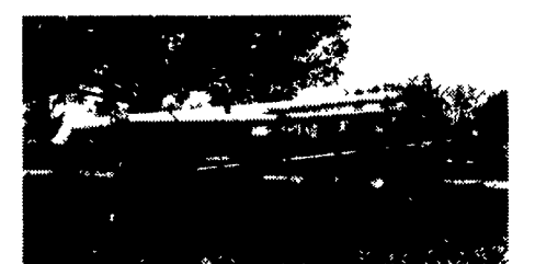
2002 Houle 32ft. Multi-Purpose Lagoon Pump 8" Fill, Heavy Duty Drive Line