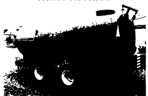
1990 Calumet 3250 Gal. Tank Spreader, 19Lx16.1 Tires, 540 RPM $6,800

Houle 9 ft. Stationary PIT PUMP Like New $3,700