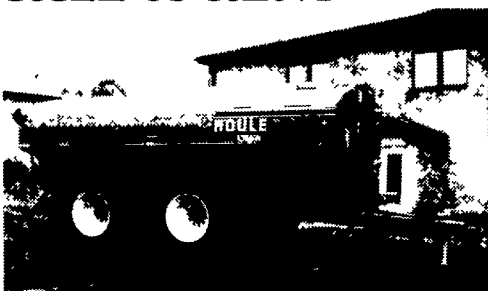
2002 Houle 4300 gal., lights, brakes, 28Lx26 tires