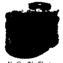
No Gas/No Electric MODEL 2008 8 Gallon