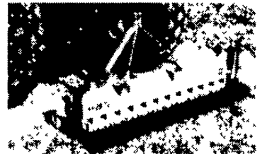
PULVERIZERS * 48" Through 84"