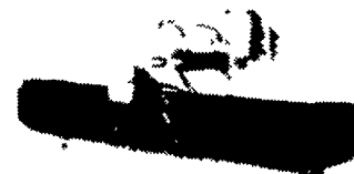
REAR BLADES 48" Through 120"