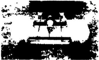
ROTARY CUTTERS 48" Through 120"