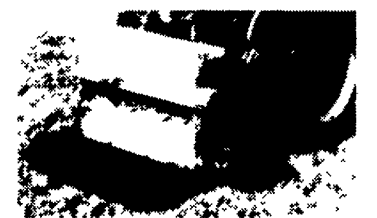
OVER SEEDERS & PRIMARY SEEDERS * 48" And 72"