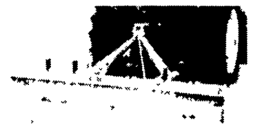
BOX SCRAPERS 42" Through 96"