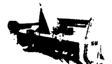
TILLERS * 42" Through 76"