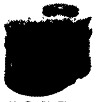
No Gas/No Electric MODEL 2008 8 Gallon