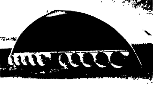
Free Stall Barn, Elizabethtown, PA