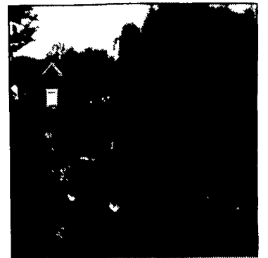
JD 1565 front mower

Engineered for operator comfort and safety, the 1565 is outfitted with a deluxe, Grammer seat that adjusts to accommodate operators of different