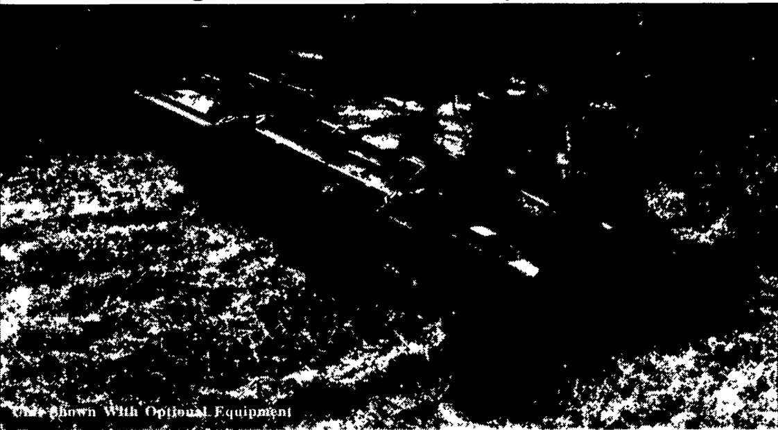
Unit Shown With Optional Equipment