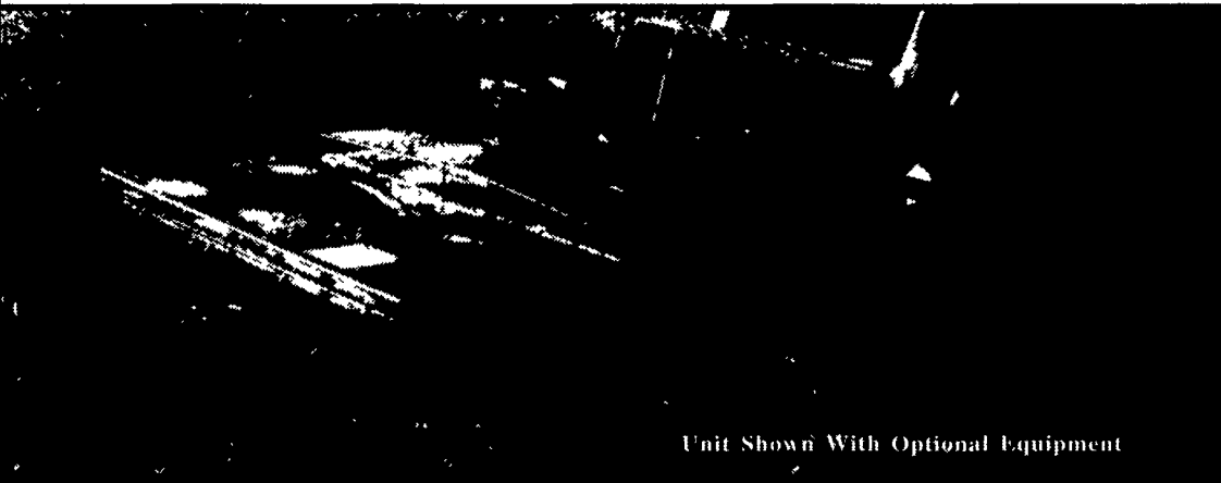
Unit Shown With Optional Equipment