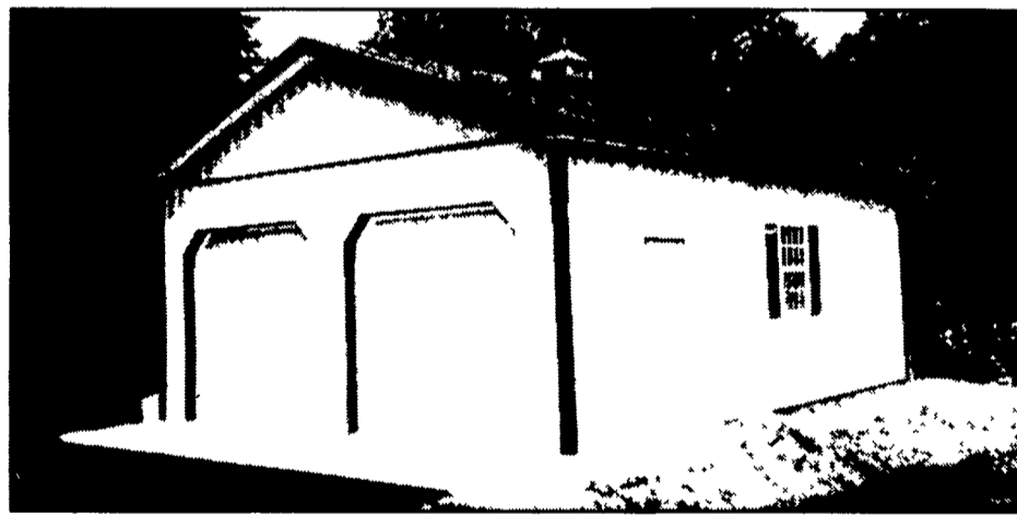
24x32x10 2 Car Garage with all the extras