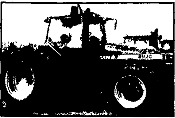
(2) Case IH 8920 900 Hrs. & 1,600 Hrs.